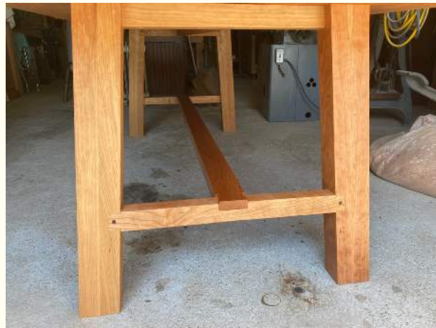
Chris's Curly Cherry Table