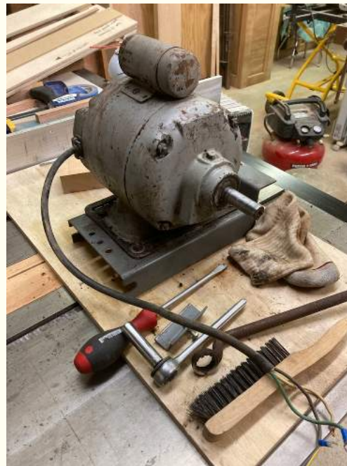
GE Motor Restored! Check Out The Historical Nameplate.

Conclusion: The LUXCUT cutterhead has been one of the best investments I have made for my shop. I do consider it an investment. It's an investment by giving me a finish ready surface meaning less time sanding. It's an investment in surface preparation on figured wood. It's an investment in future time savings by me never having to adjust jointer knives. If the LUXCUT is available for your jointer or planer, I highly recommend the "investment". I was hesitant about the purchase, but now that I've seen the quality of the cutterhead, the reduction in noise and the quality of the cut, I am so glad I made the leap!