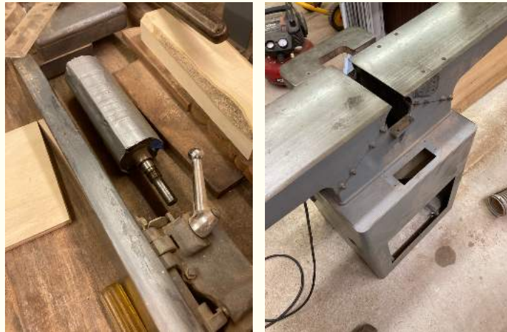
The Old Cutterhead (Left) & Jointer Without Cutterhead (Right)

I'm sure everyone has had something like this happen. I'm close to finishing a cherry table for a client, trying to meet a deadline, and my jointer begins screaming while I'm working on the leg assemblies. A little background. Twenty-five years ago I was looking to upgrade from a 1948 6" Delta jointer. I found a 1964 8" Rockwell jointer in the local trading post, the original 3-phase Rockwell motor that had just been re-wound. The seller had no takers for the jointer apparently because it was 3-phase I went to take a look at the machine and immediately bought it. Got it home and completely disassembled it, cleaned it up and put it back together. I put the motor control and 3-phase motor in one of my cabinets and pulled out a 1940 GE 3/4 HP 120 V single phase motor that I got from my brother-in-law's father. For twenty-five years the jointer ran fine, just a real pain in the behind to change out knives and adjust them. I'm sure everyone knows what I'm talking about!