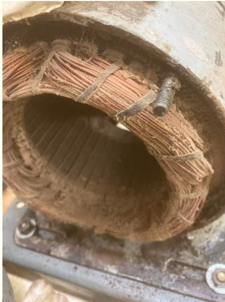
A Look At A 1940 GE 3/4 HP 120 V Motor With 82 Years Of Dust & Dirt Buildup. Amazing It Still Works!