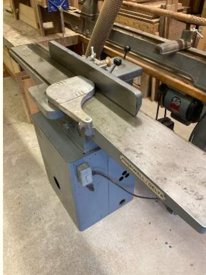
A Look At The Newly Installed Helical Cutter Head And The Refurbished Rockwell / Delta Jointer!

Any guild member is welcome to contact me and see it in action!