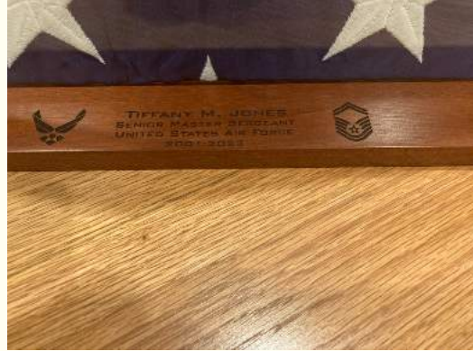
Mahogany Flag Case & Laser Engraving