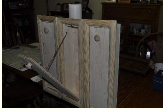
3 Toilet Bowl Wand Bathroom Holders For Their New House

Our last project comes from Chris Haycox.